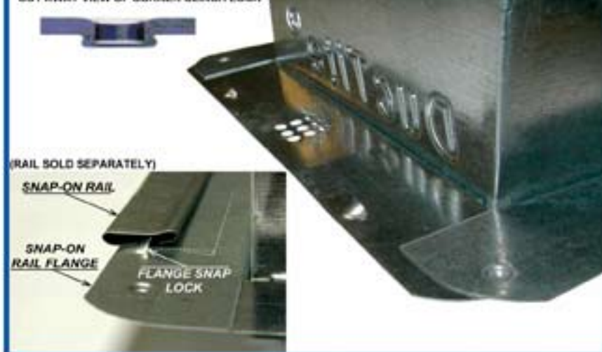
CUT AWAY VIEW OF CORNER CLINCH LOCK

*DucTite Register Boxes conform to IRC M1601.3.1 which requires joints and seams to be "Substantially Airtight".