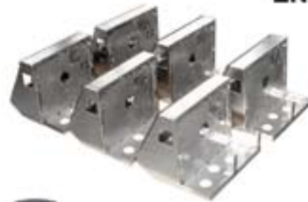
NEMA & UL ENCLOSURES