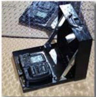
MOBILE MOUNTS FOR ELECTRONIC EQUIPMENT

M&M Precision Products provides a wide range of custom sheet metal fabrications built to your specifications.