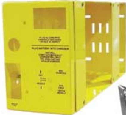
POWDER COATING SILK SCREENING

M&M Precision Products can meet your needs when it comes to precision tolerance sheet metal fabrication. From laser cutting, to CNC brake press forming, to robotic welding, M&M Precision Products defines the standard for custom sheet metal fabrication by providing competitive pricing with uncompromised product quality and on-time deliveries.